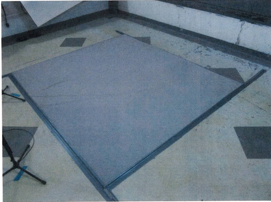
Installed Specimen Midway Mineral