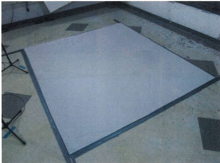
Installed Specimen Columbus Silver