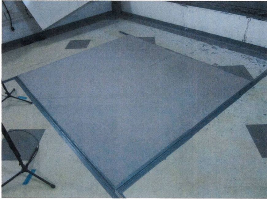
Installed Specimen Alliance Taupe