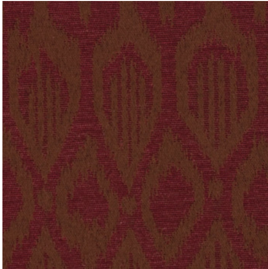
Repeats Not Shown to Scale.